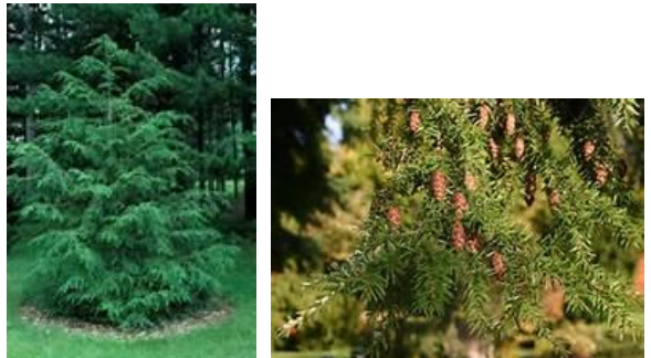
Canadian Hemlock -Short, soft light yellow green needles in spring changing to glossy dark green. Likes moist, organic well-drained soils. Tolerates shade well. Does not tolerate drought and wind.