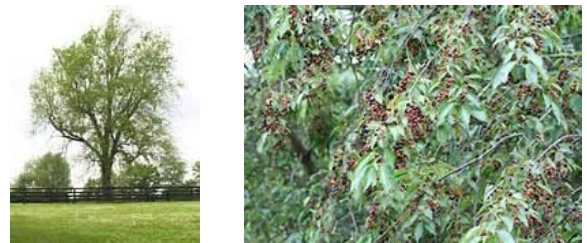
Black Cherry - Grows to 60 feet. A valuable timber tree which can be planted in the open or as an underplanting. Dense foliage with green lustrous leaves, single white flowers in late May producing black cherries in August. Good species for wildlife food. Does well in a wide variety of soil types.