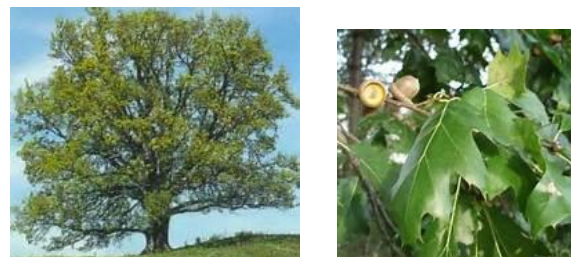
Red Oak – Fast growth 60 to 70 feet with equal spread. Its dense, lustrous green foliage turns a deep red in the fall. Grows best in sandy to rich loamy soil in full sun. The fastest growing of all oaks. One of the most popular ornamental oaks. It transplants easily, and withstands city conditions.