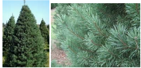
Scotch Pine – Beautiful evergreen with rigid, bluish green needles. A vigorous growing, hardy plant, adjusts itself to dry soils. Easily transplanted. One of the fastest-growing of the pine family. Popular for Christmas tree producers, a good ornamental for specimen planting. Excellent for windbreak use.