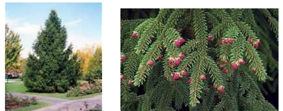
Norway Spruce – A graceful pyramidal with shiny, dark green needles. Beautiful spreading branches with drooping twigs. An extremely hardy tree that grows in most soil conditions. Makes a charming Christmas tree, an appealing ornament specimen, or a protective windbreak. Fast growth makes this spruce ideal for timber.