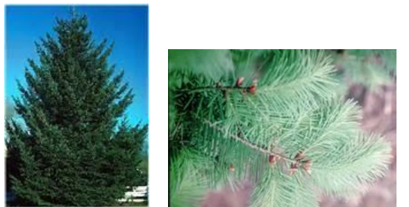
Douglas Fir - A splendid pyramidal evergreen conifer, with short-stalked flat, dark green or bluish green needles, ¾ to 1" long. Bears 2 to 4" cones at maturity. A hardy, rapid growing tree that does well in a variety of soils, but does best in deep, well drained soils. Beautiful Christmas tree, picturesque ornamental, windbreak and can be sheared as a hedge.