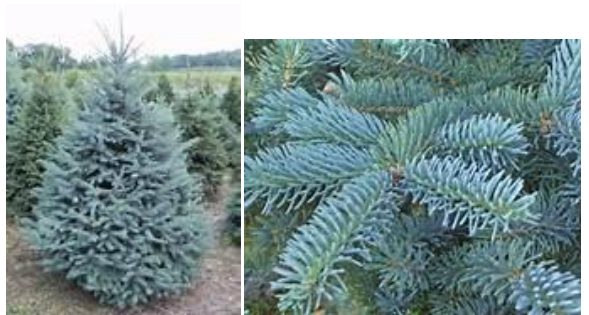
Colorado Blue Spruce – A handsome ornamental specimen or use as a dense, colorful screen or windbreak. Does well in ordinary soil with average moisture and full sun. Color in Colorado Blue Spruce is influenced by spacing and soil fertility.