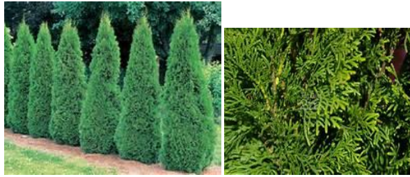
American Arborvitae -Grows to 40 ft. Evergreen foliage is scale-like and flat. Grows well in ordinary soil. Well suited for windbreaks and privacy borders.