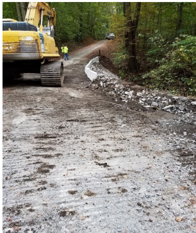
Stabilization of an eroded portion of road bank on Chewton West Pittsburg completed last summer.

Join us on Facebook and Instagram to follow this year's projects during construction.