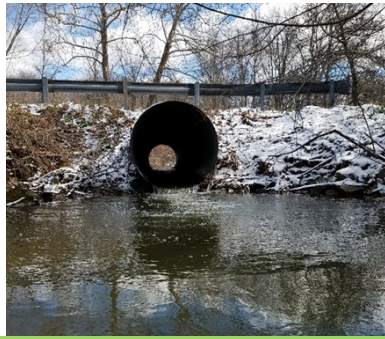
Existing badly perched pipe on Lakewood Neshannock Falls

Hickory Township will be replacing a failing 60-inch pipe culvert on Lakewood Neshannock Falls Road with a new prefabricated footer arch culvert. Installation of the new structure will include providing a span over 12 ft. wide to allow for better stream flow through the pipe, better alignment to mitigate stream bank erosion and elimination of a large plunge pool at the outlet. The District will be providing the township with funding and technical assistance throughout the project anticipated to begin construction later this summer.