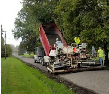
Paver placement of DSA during the 2018 season in Mahoning Township

Shenango Township will be taking on the task of converting the driving surface of Chewton West Pittsburg Road. Last year, the municipal road forces undertook the job of improving the drainage on a portion of the road that allows for the stormwater to be better managed and less sediment to wash into our waterways. This year's project will be a continuation of the efforts. For the first time in Shenango Township, they will be converting a badly damaged chip sealed surface to an aggregate road surface using the program's Driving Surface Aggregate (DSA). DSA is a blended mix of varied particle sizes to "lock up" with proper compaction to provide less sedimentation and a longer maintenance cycle.