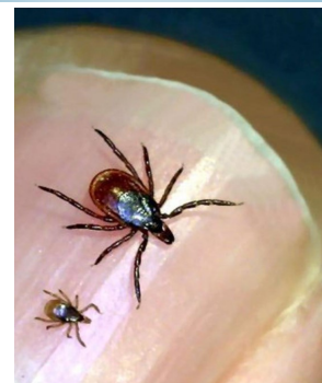
Black Legged (Deer) Tick

*Information on ticks and tickborne diseases, visit the Centers for Disease Control and Prevention's website. *Information on Lyme Disease, visit the Department of Health's Lyme Disease webpage.